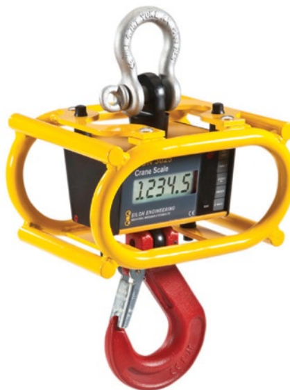
Crane Scale with Integrated 1" Display