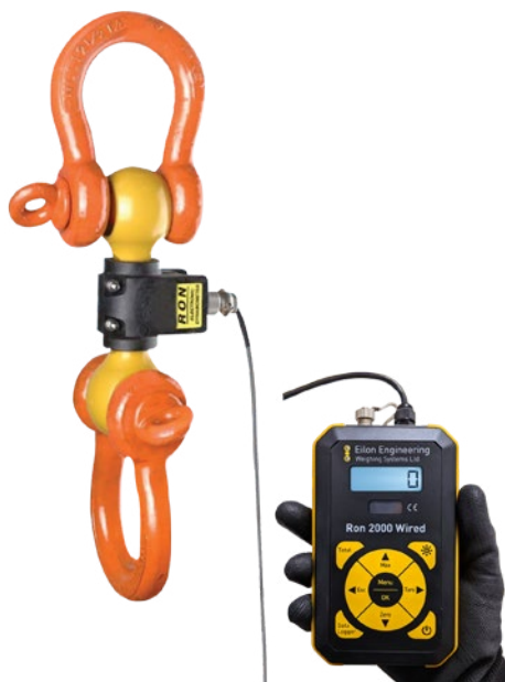
Dynamometer with wired remote display.