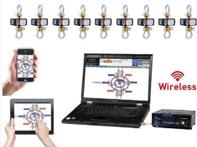
Multi Load Cell System