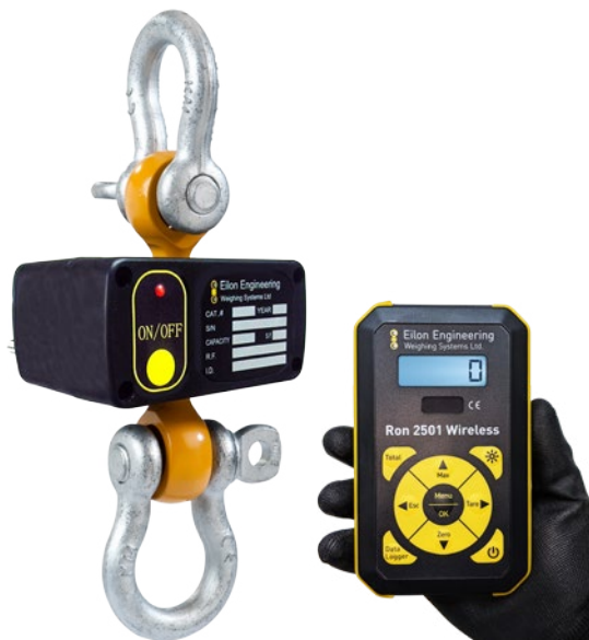
Dynamometer with wireless remote display.