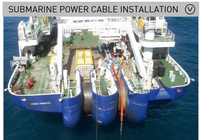
SUBMARINE POWER CABLE INSTALLATION ✓